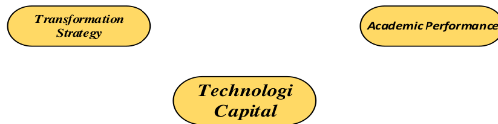
Chart 1. Conceptual framework